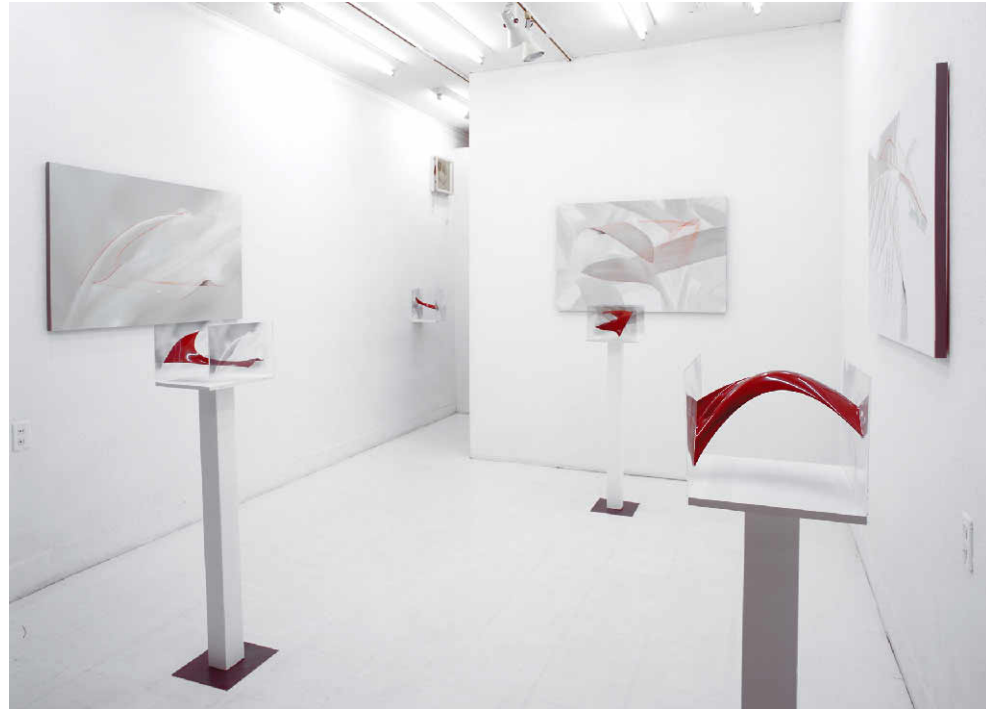
Exhibition in Kyoto Art Space NIJI Oct. 2003